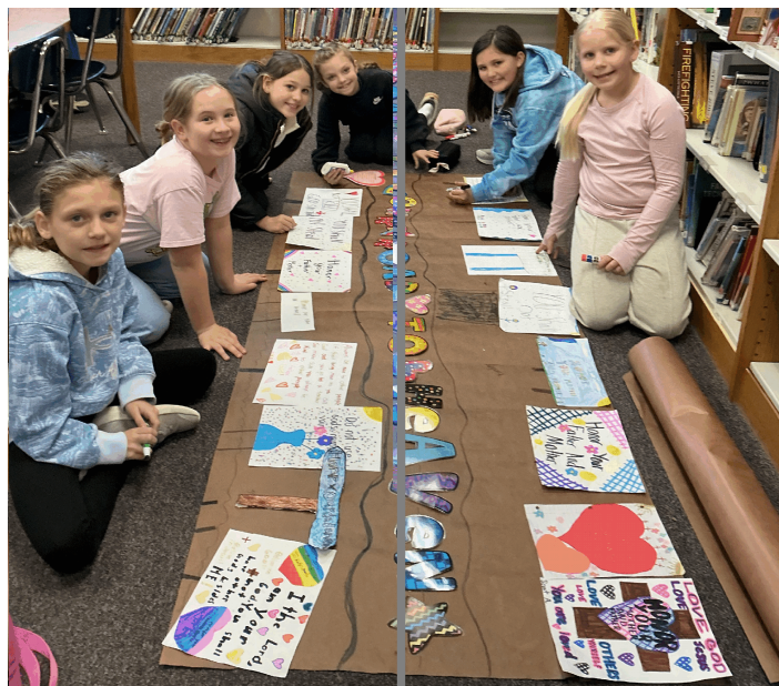
3 rd grade PSR: Building posters about the Ten Commandments.

Your General Fund contribution enables FAITH IN ACTION