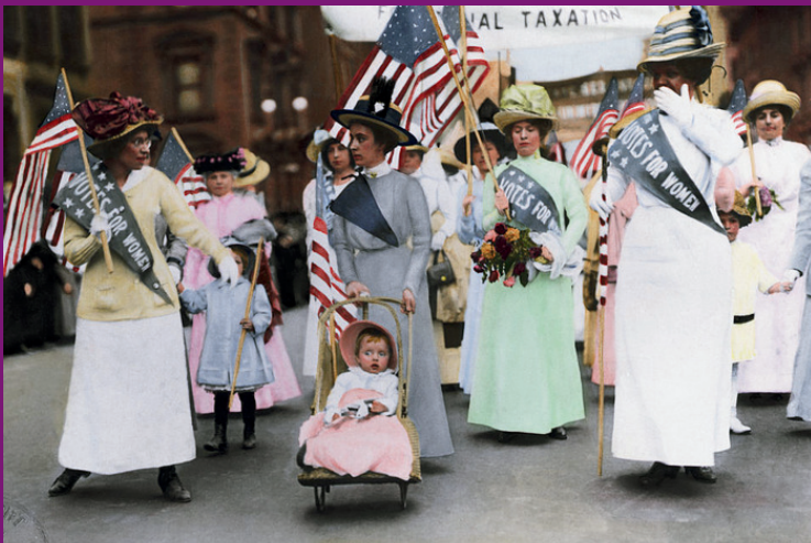
Marching For Equality: Suffragettes parade through New York City May 1912

YOUR VOICE, YOUR VOTE, YOUR TOMORROW! VOTING IS YOUR SUPERPOWER!