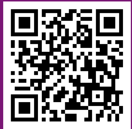
Scan the QR Code to watch Suffs The Musical on PBS

Primary Election Day is Tuesday, June 23, 2026 General Election Day is Tuesday, November 3, 2026