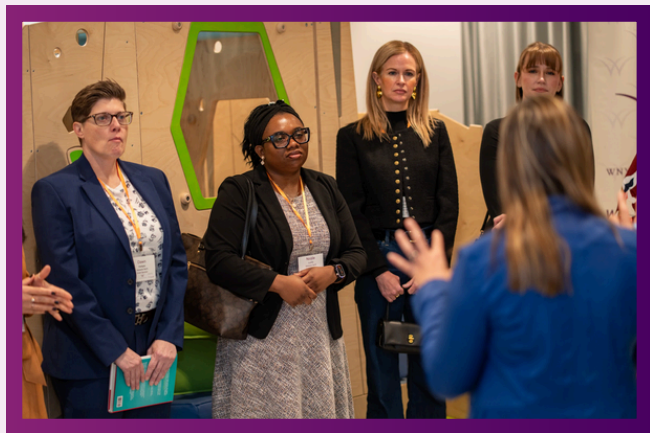
What Shes Made Of Attendees