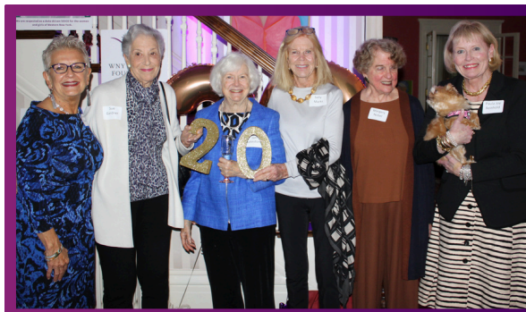
Some Torch Circle members at 20th Anniversary Celebration, 2019

To learn more about legacy giving opportunities, contact the WNY Women's Foundation by phone at 716-217-9056 or via email at wnywfdn@wnywfdn.org .