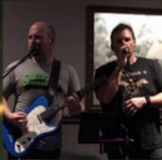
THE 2 DUDES