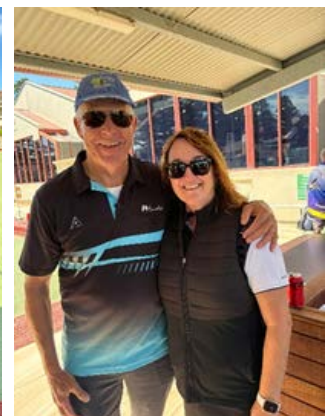
Happy Autumn Classic Families!