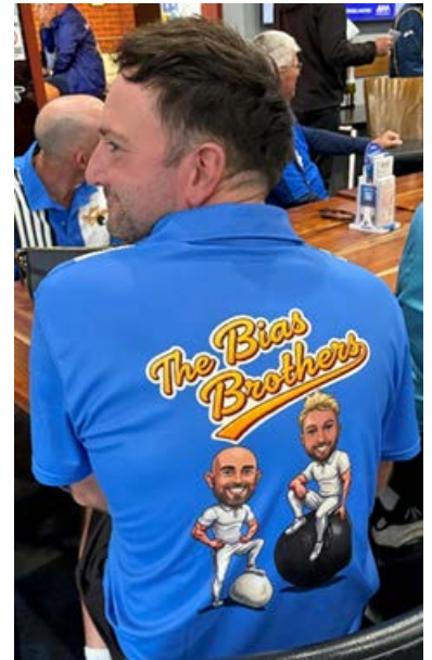
Great to see the Jones brothers back for the Classic – apparently dad was too busy swanning around Japan!