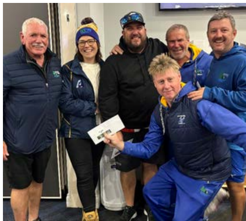
The 'Deal' dancing his way into the money.