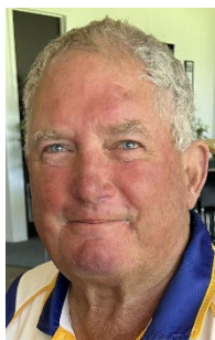
Bill Hunting Match Committee