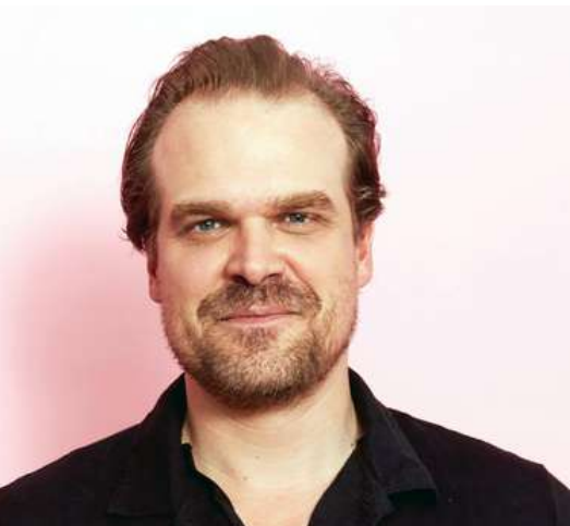
David Harbour (2020)