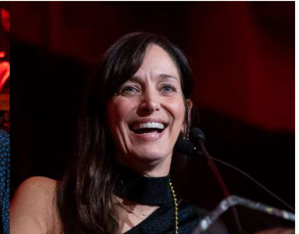
Chantal Kreviazuk (2022)