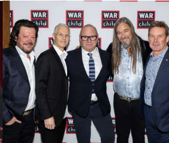
The Tragically Hip (2023)