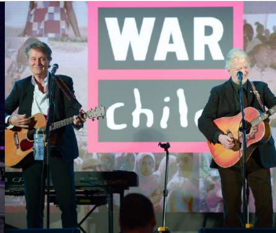
Jim Cuddy & Greg Keelor of Blue Rodeo (2024)