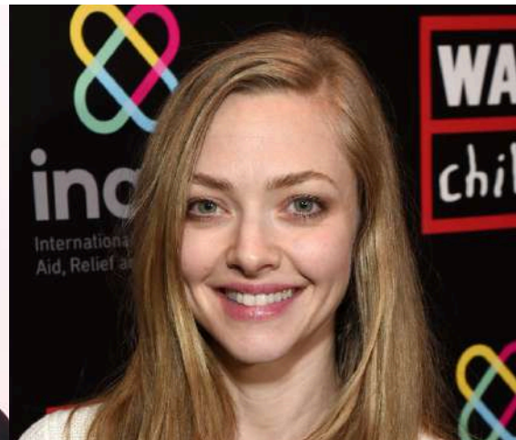
Amanda Seyfried (2019)