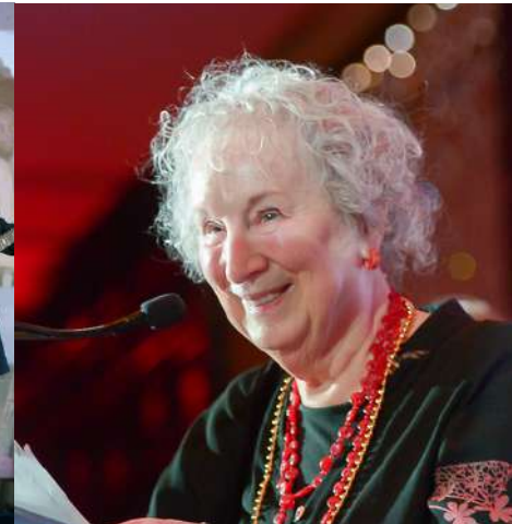
Margaret Atwood (2024)