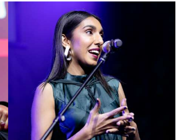
Rupi Kaur (2018)

...and more, including Alex Lifeson, Rick Mercer, Sarah McLachlan, Sarah Rafferty, Troian Bellisario, Thomas Sadoski, JP Saxe, Patrick J. Adams, Ashley Park, Colin Mochrie, Sheاون McKinney, Josh Radnor, Amaal Nuux, LP, and more.