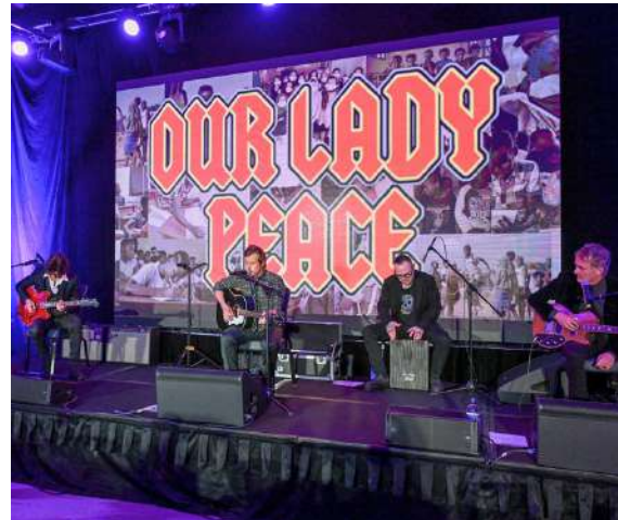
Our Lady Peace (2025)

Past notable War Child supporters and participants include: