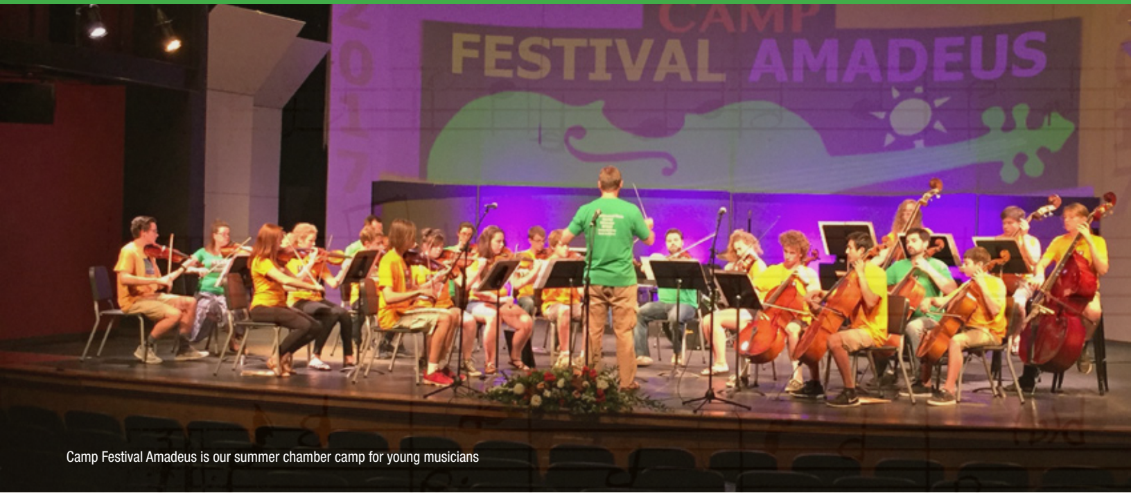
Camp Festival Amadeus is our summer chamber camp for young musicians