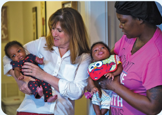
CHAZ MUTH / CNS