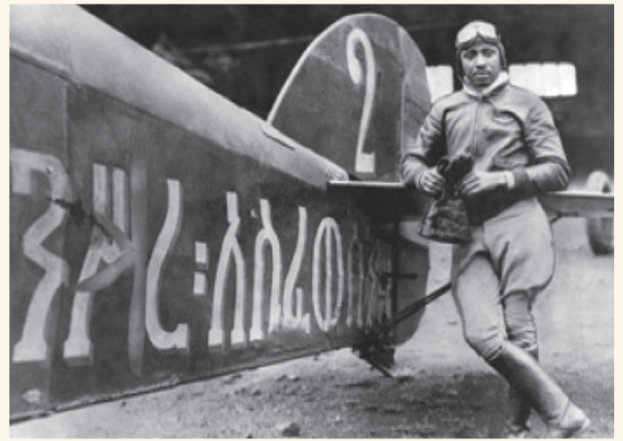
John Charles Robinson (November 26, 1903-March 27, 1954) was an American aviator and activist, known as the "Brown Condor" for his service in the Imperial Ethiopian Air Force against Fascist Italy. Robinson pushed for equal opportunities for African Americans during his early career and was able to open his own aviation school in Chicago, in addition to initiating a program for Black pilots at his college, Tuskegee Institute (now Tuskegee University). Robinson has been called the father of the Tuskegee Airmen.

History records that aviation proficiency for pilot training and aviation maintenance in Ethiopia benefited from the leadership of Col. John Robinson, aka "The Brown Condor." Robinson was the most eminent African