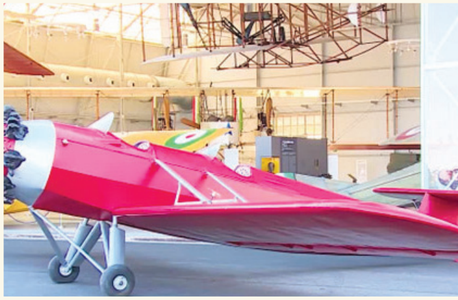
Ethiopia's Tsehay I (manufactured in 1935) – The First Aircraft built in an African led nation was returned by Italy in 2024

Italian forces in 1936 but finally returned to Ethiopia on January 30, 2024. The Ethiopians have built a light trainer aircraft, Tsehay II, as of 2024, as they continue to advance in aircraft manufacturing.