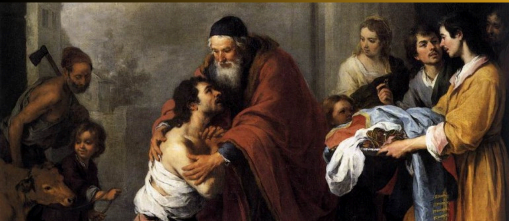
The Return of the Prodigal Son, Bartolome Esteban Murillo