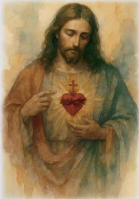
Sacred Heart of Jesus we Trust in You