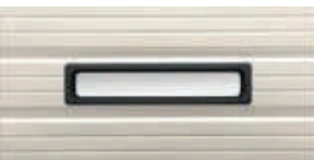
Small TL Lite - 24" x 6"