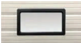
Large TL Lite - 24" x 12"