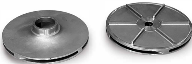
Hydrodynamically Balanced Impeller

Our company goals are to provide the solutions that protect our surroundings, raise the environmental awareness, and promote the growth of the community.