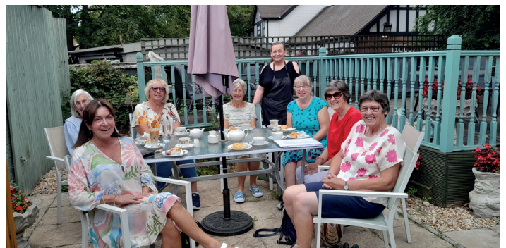
The members of the Waltham in Bloom volunteer group are rewarded with a cream tea, kindly provided by The Blue Dragonfly tearoom, as a thank-you for their hard work with the floral displays around the village.