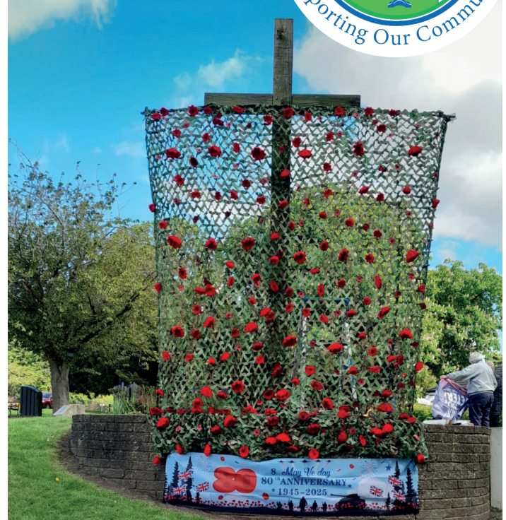
Poppy display on the Village Green to commemorate VE Day 80. Created by Tracey Griggs who knitted over 250 poppies.

Our quarterly newsletter is now delivered to every home in the DN37 postcode, keeping you all up to date with local news and plans. If you have not received a copy or have received more than one please let us know.