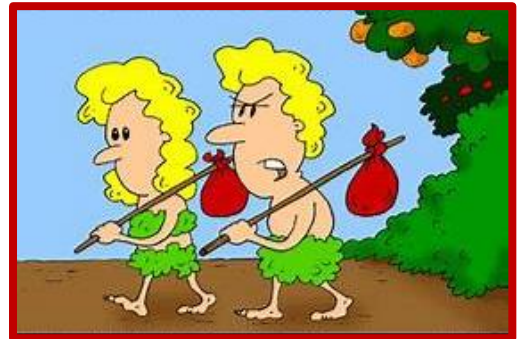
“I WANT MY RIB BACK!”