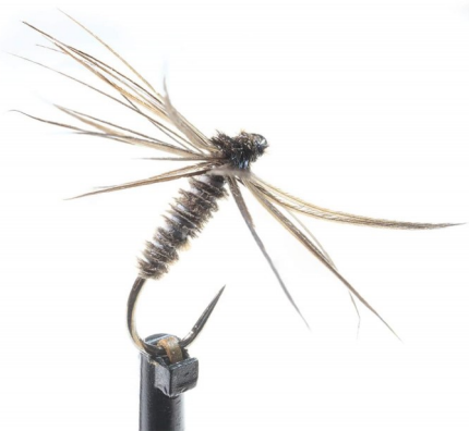
Rusled Midge or Castle Rook