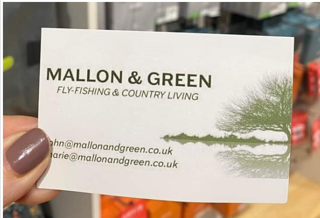
End of an Era