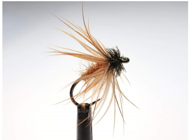
The Willow Fly

Hook: Partridge SUD # 14 Silk: Purple Body: Dark fur from a fox ear Hackle: Jay's Wing Head: Peacock herl