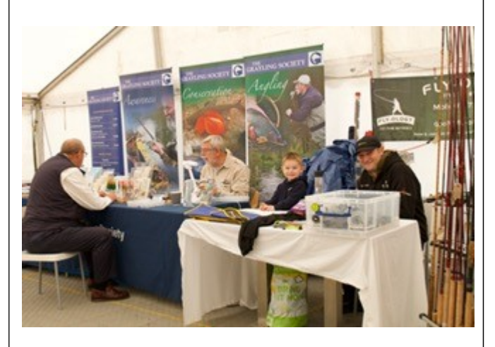
Chatting about Grayling and the Society