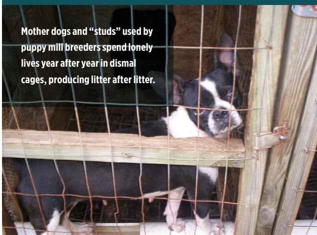
Mother dogs and “studs” used by puppy mill breeders spend lonely lives year after year in dismal cages, producing litter after litter.