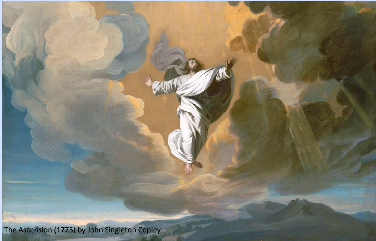
The Ascension (1775) by John Singleton Copley