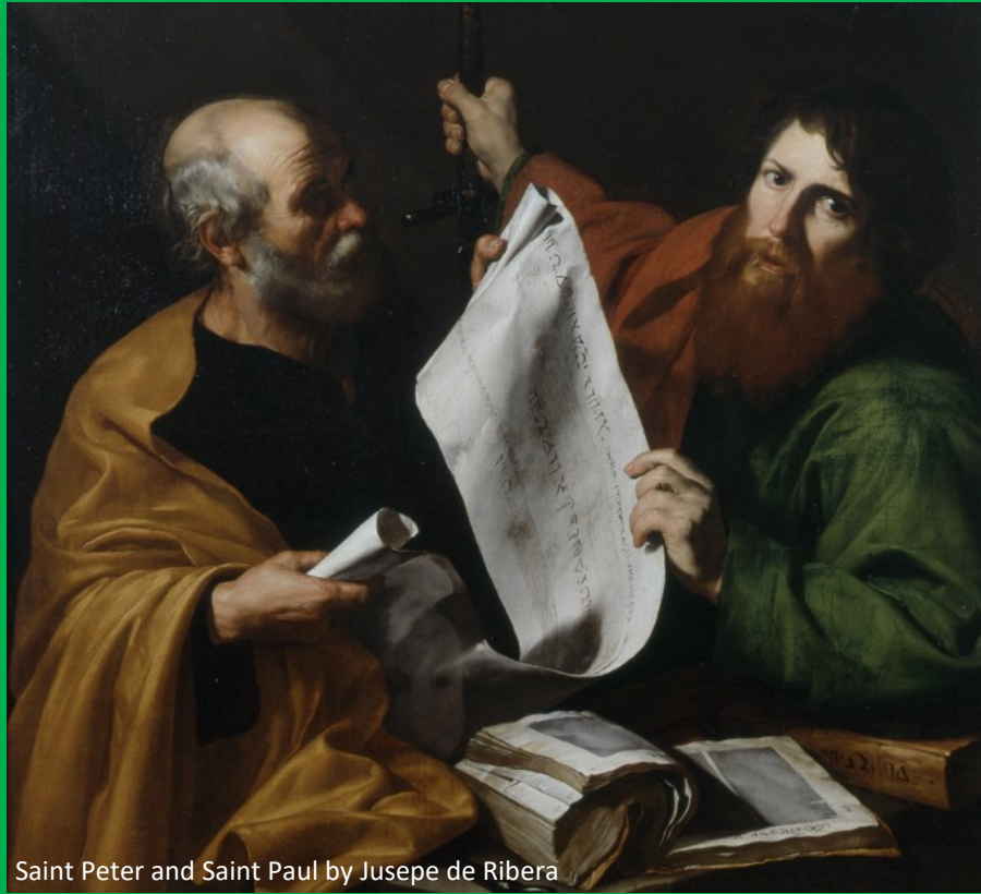
Saint Peter and Saint Paul by Jusepe de Ribera