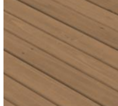
_____ Stain/Paint Color 2

Semi-Transparent 726 Light Mocha Olympic