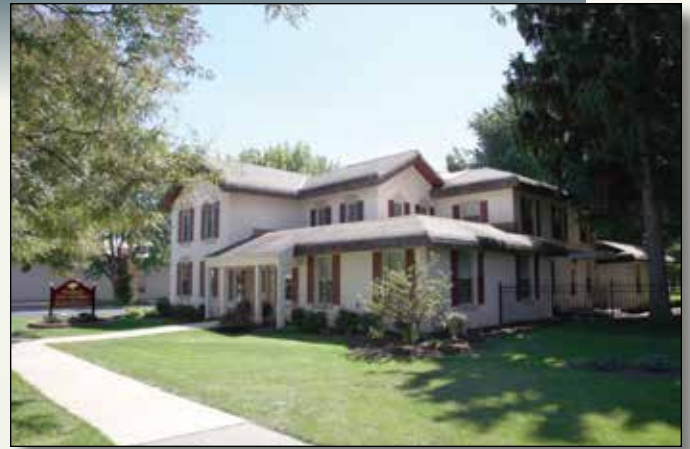
Wonderly Horvath Hanes Funeral Home & Crematory Currently

211 N. Broadway Street | Green Springs, OH 44836 | (419) 639-2771