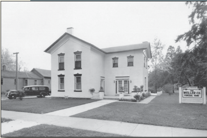
Weller Wonderly Funeral Home 1934

425 E. State Street | Fremont, OH 43420 | (419) 332-6409