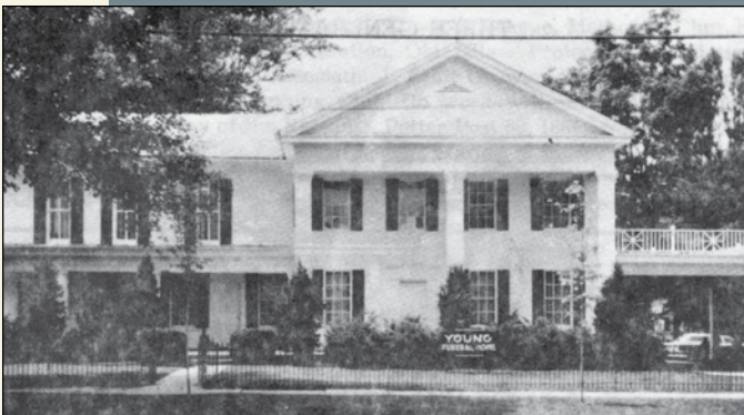
Young Funeral Home 1873

211 N. Broadway Street | Green Springs, OH 44836 | (419) 639-2771