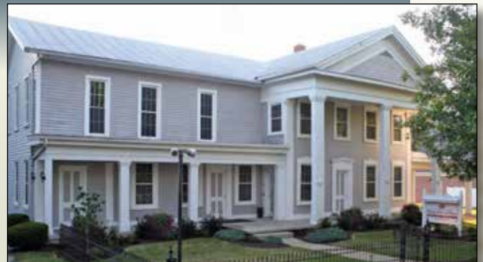
Horvath Hanes Funeral Home & Crematory Currently