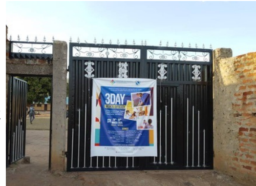
Poster for the Medical Outreach on the gate of Ogul Village School.

We are excited to share that during the three day camp, our pastors will be sharing the gospel with all attendees and we will be showing the "Jesus Video" to all. We anticipate the cost to be around $20,000 for supplies, cancer tests, and surgical supplies. You can give today to help offset these costs at www.amigosii.org/donate .