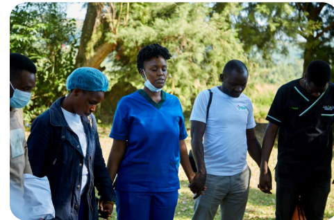
Physicians gather and pray for a harvest of souls as they meet physical needs in camp.