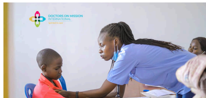
Doctors coming to help our Missionpoint at Ogul Village