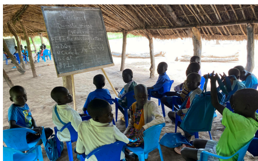
School is scheduled to begin March 1