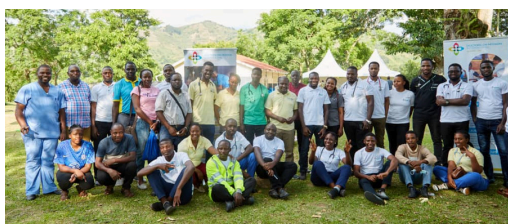
Team of doctors coming to help our Missionpoint at Ogul Village