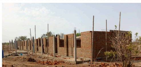
Give to build a school in Burpong