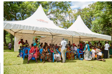
People gather from the village to get FREE medical and dental treatment