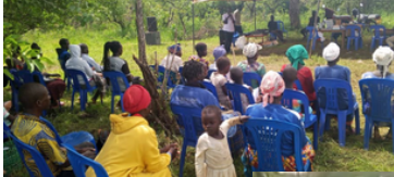
Children from Agape Church-Loyoboo sing while crowd waits