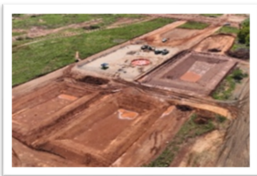
Groundwater treatment ponds

Based on construction progress so far, the groundwater treatment plant is expected to start treating water in October 2026.