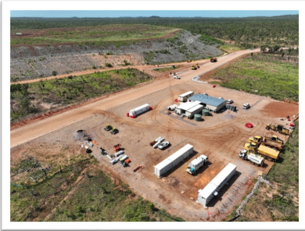
Onsite office facilities and lay down area

The completion of the Stage 1 haul road was a key milestone, supporting safer and more reliable site access. Work continues on the different sections of the Stage 2 haul road, which will improve future connectivity across the site including access to the Main Pit to enable backfill.