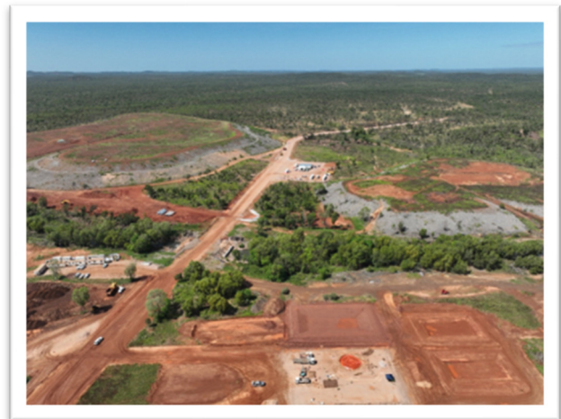
Haul road passing the groundwater treatment ponds

Site establishment continued to move forward, with the onsite facilities including crib rooms, ablutions, workshops, and fuel systems now operational. NT link started delivering the new buildings for the site office, with installation to be completed in early June. The new office will be equipped with a meeting room that can be used to host various project meetings.