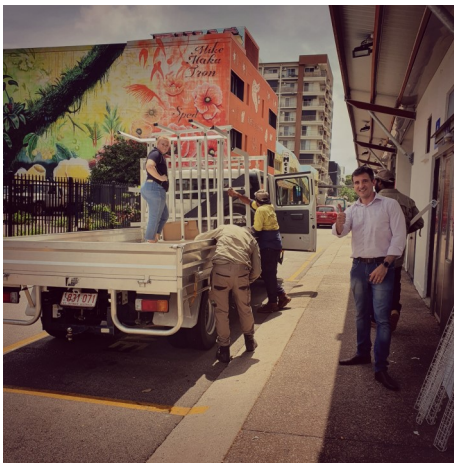
Pictured: Recycled furniture for the Batchelor office on its way from Darwin City.

The Rum Jungle Rehabilitation Project Team are currently ramping up efforts to move our office to Cameron Road, Batchelor. Everyone is excited to soon be on the ground in Batchelor to bring our project to life in 2023. The Project has engaged local business to carry out Pest Control, removal of an old demountable & deep clean the office. Our team have been hard at work starting garden maintenance. The aim is to be move in ready by the end of March 2023.