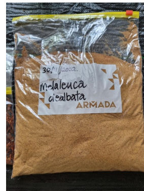
Melaleuca Dealbata AKA Blue Paperbark Tree seeds in storage