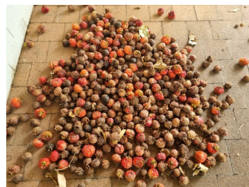
Syzygium suborbiculare AKA Red Bush Apple Tree with fruit & the fruit of the Red Bush Apple being dried ready to collect the seeds.