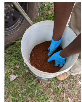
Anastasia homogenising soil samples