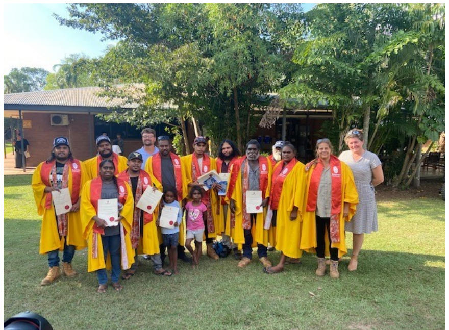
Pictured—Our last round of Rum Jungle Project Trainees who graduated April 2022.