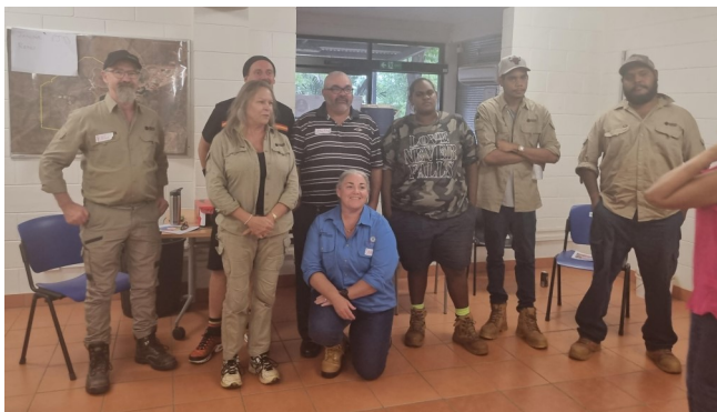
Team building day 1 included the land management team, the Community engagement team & the Director of Work Health and Environment.

The Rum Jungle Rehabilitation Project Team have undertaken 2 team building workshops in November and December 2022 with All Aspects Recruitment & HR Services in Batchelor. The workshops provided an opportunity for the entire Project Team to come together with a focus on becoming a more cohesive, productive and professional work unit. The two days saw us share personal journeys with each other, build stronger relationships, identify shared team values, look at ways to improve team dynamics, and strengthen team culture all with the aim to position the team to be better placed to deliver the goals of our project.