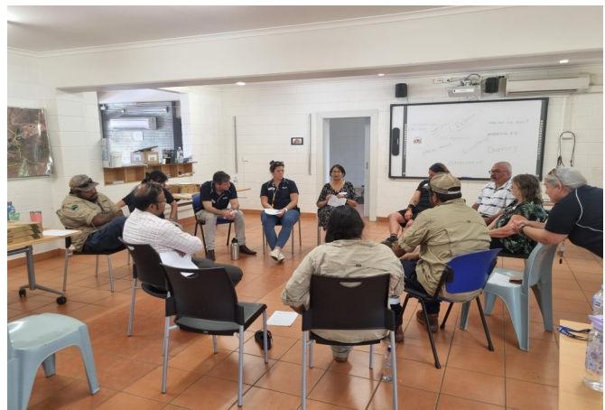
Team building day 2 included everyone who was available from both our Darwin and Batchelor work locations.