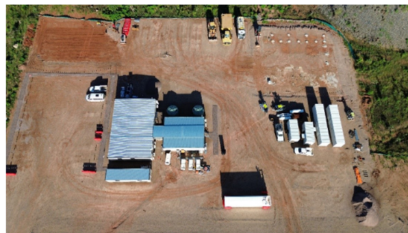
Internal site facilities