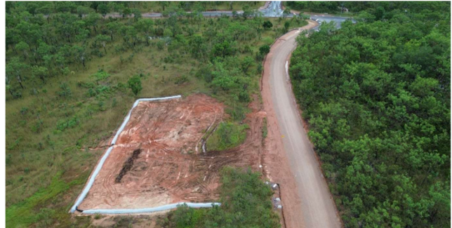
Clearing of front gate office facilities area