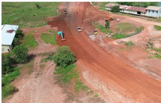
Haul road construction north of the Main Pit

Bulk earthworks activities planned for the coming months will include haul road construction, and the development of the Finnis River Aboriginal Land Trust and Coomalie borrow pits to provide sand, gravel and other fill material required for construction works.