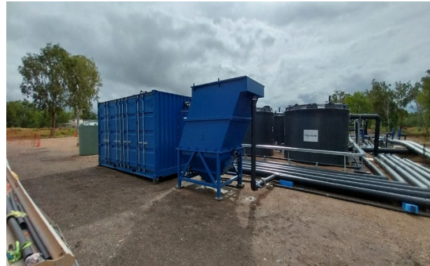
Surface Water Treatment Plant clarifier