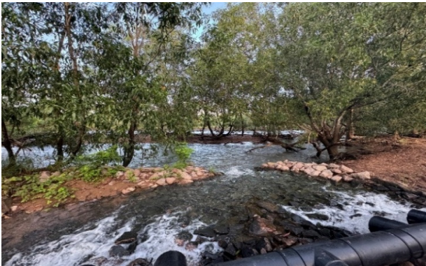
Treated water being discharged to the East Branch Finnis River

While the construction of the Groundwater Treatment Plant progressed, foundation preparation activities were impacted by the rainfall. Construction and commissioning are now expected to be complete in September of this year.