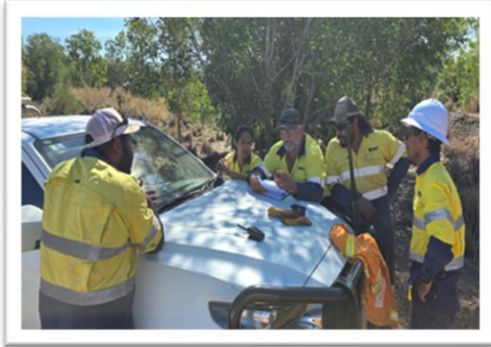
Land Management Team – planning meeting prior to conducting the first burn of the season

This quarter, the Land Management Team continued to undertake general site activities, including erection of new signage to ensure clear demarcation of cultural heritage conservation zones, maintenance perimeter fences, and routine checks of site monitoring bores. The team undertook and completed their first burn on site in June, and they are now planning additional burns for the remainder of the season.