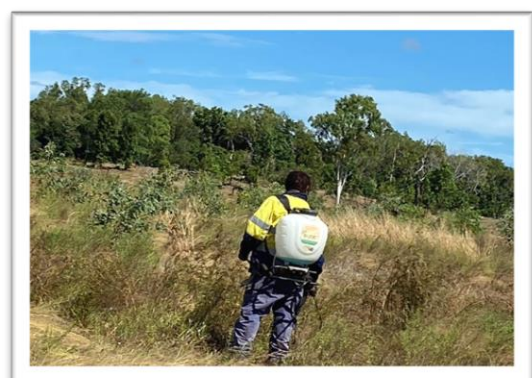
Weed spraying – backpack