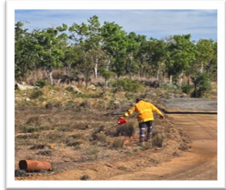
Land Management Team –conducting the first burn of the season

The team recently participated in water monitoring training and undertook a comprehensive audit of all water quality monitoring stations. As a result of this, new surface water quality monitoring equipment has been installed, ensuring accurate water quality monitoring can be conducted throughout the rehabilitation Project. Both the existing and new water monitoring equipment, some of which was previously managed by NT Water Resources, will now be managed and maintained by the Rum Jungle Project Team.