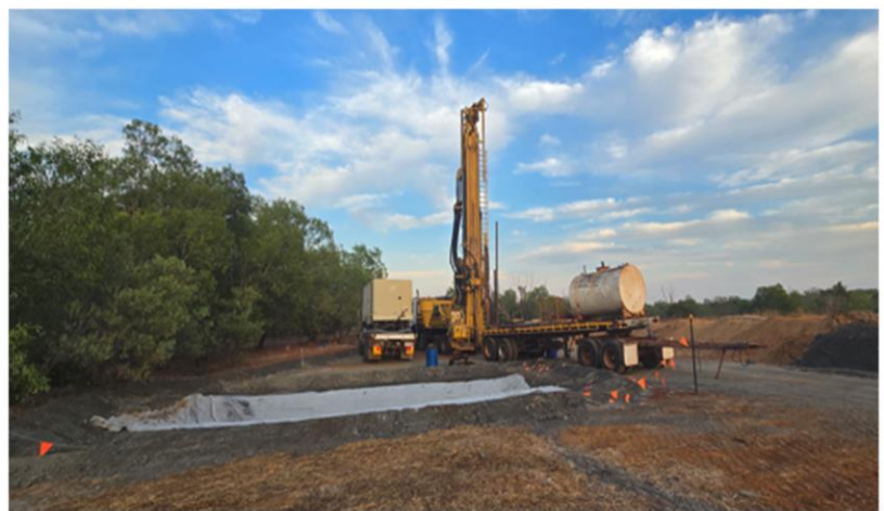
Bore set up to commence drilling on site.