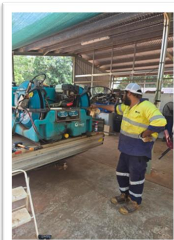
Servicing and maintenance work on land management equipment

The team recently participated in water monitoring training and undertook a comprehensive audit of all water quality monitoring stations. As a result of this, new surface water quality monitoring equipment has been installed, ensuring accurate water quality monitoring can be conducted throughout the rehabilitation Project. Both the existing and new water monitoring equipment, some of which was previously managed by NT Water Resources, will now be managed and maintained by the Rum Jungle Project Team.