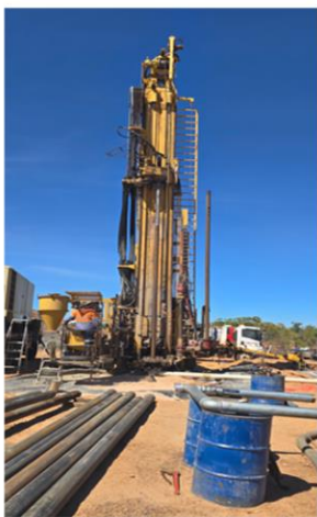
Bore assembly in preparation for drilling on site