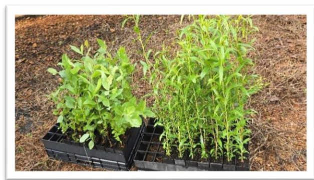
Tube Stock – awaiting planting