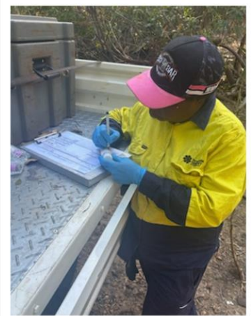
Recording of water monitoring results