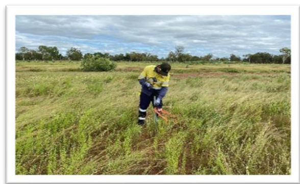
Pegging of next Revegetation section