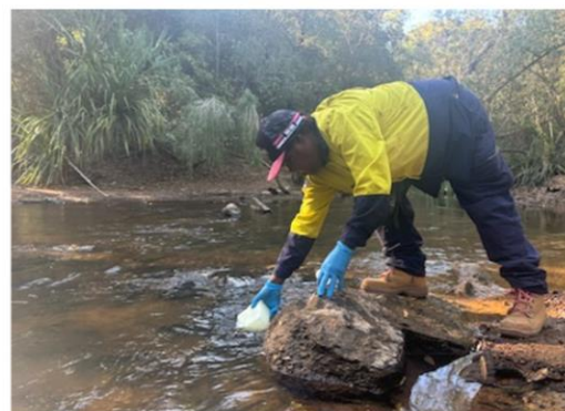
Collecting water samples as part of the water monitoring program