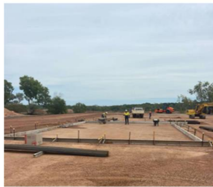
Initial formation works in preparation for concrete foundation of the surface water treatment plant