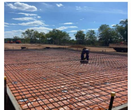
Final formation works in preparation for concrete foundation of the surface water treatment plant