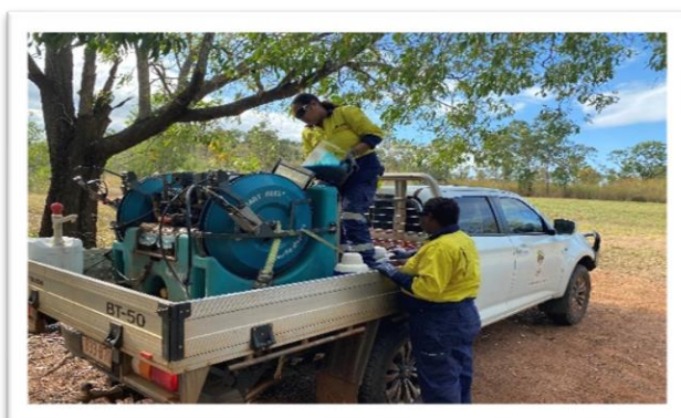
Weed spraying – light vehicle

The Rum Jungle Land Management Team and weed management contractors continue to undertake light vehicle weed management activities, with a focus on targeting gamba grass before it seeds across various areas of both the Rum Jungle and Coomalie Council Borrow sites.