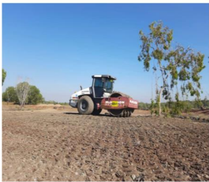
Levelling of ground for water treatment plant