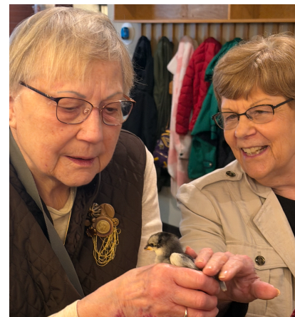
Some young chicks came to visit in April for our "All Flourishing is Mutual" worship series.