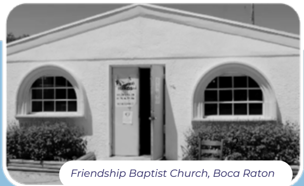
Friendship Baptist Church, Boca Raton

Established in 1998, Boca Helping Hands provides food, job training, access to healthcare and financial assistance to help individuals and families improve their quality of life and build financial stability.