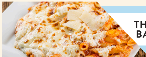
THREE CHEESE BAKED PENNE

CHICKEN PARMIGIANA Breaded chicken breast baked with marinara sauce, topped with baked mozzarella cheese, shaved asiago cheese & fresh parsley. (1630 cal) 13.99