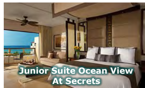
Junior Suite Ocean View At Secrets