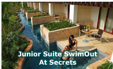
Junior Suite SwimOut At Secrets