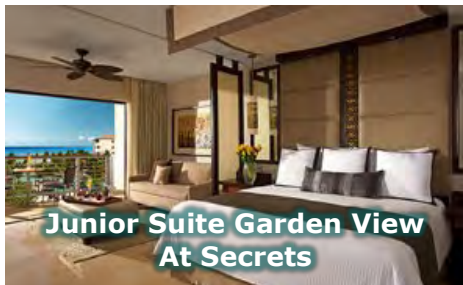
Junior Suite Garden View At Secrets