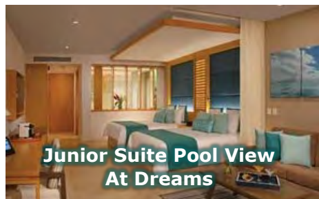
Junior Suite Pool View At Dreams

At Dreams & Secrets Playa Mujeres Golf & Spa Resort Playa Mujeres, Mexico