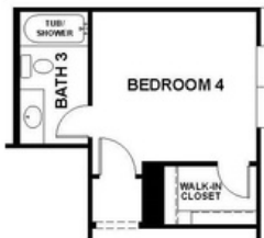
OPTIONAL BEDROOM 4 WITH BATH 3

Visit our website for additional options & interactive home planning tool.