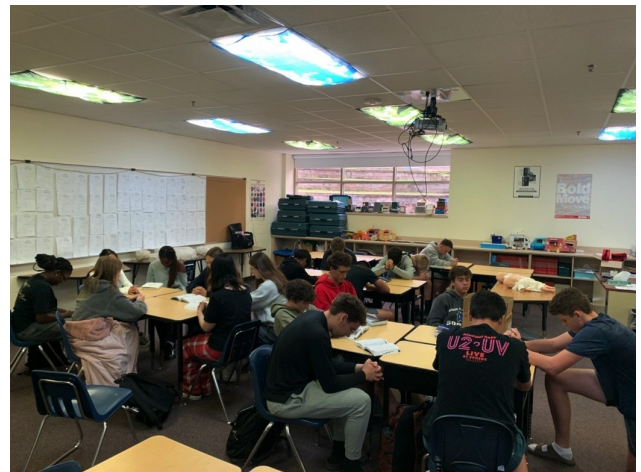
Mounds Park Academy digs into the scriptures on their last meeting of the year