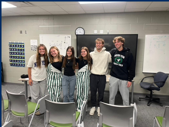
Our Mounds View student leaders led a panel to answer faith questions along with Coach Redman!