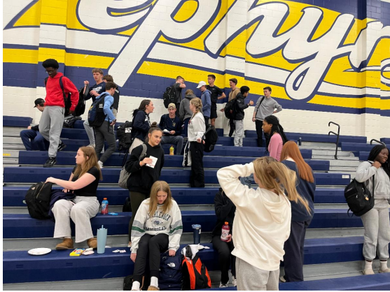
Mahtomedi hosts it's last pancake breakfast, but it wasn't without fun competitions for the athletes!