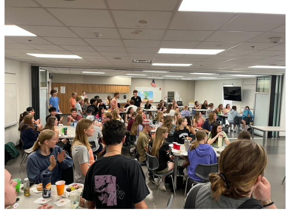
White Bear Parents put on a breakfast spread the last friday of school. 100's of people celebrating FCA at White Bear Lake and listening to testimonies of the students!