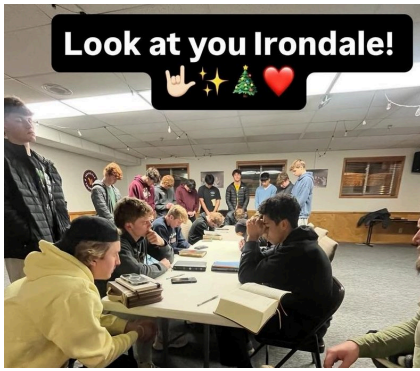
Hours and hours of time spent in prayer together.