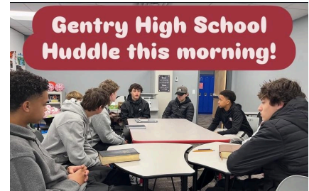
And students getting excited for what God has in store next.