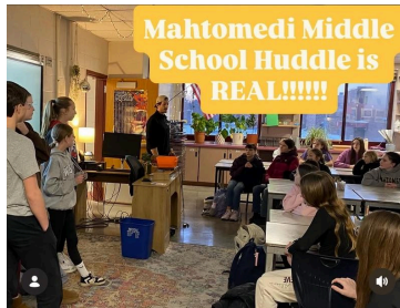
The beginning of multiple middle school huddles for the first time in our area.