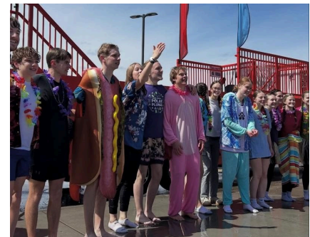
And outreaches that have impacted the world.