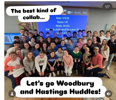
The regular collaboration of huddles from multiple schools serving or coming together for good.