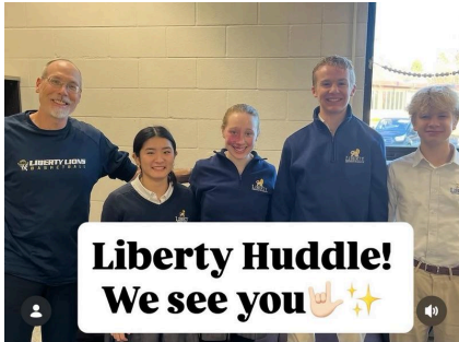
We have loved seeing brand new huddles begin.