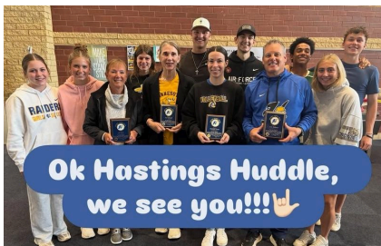
We've been so impressed by the outreaches huddles have led that have impacted their schools.