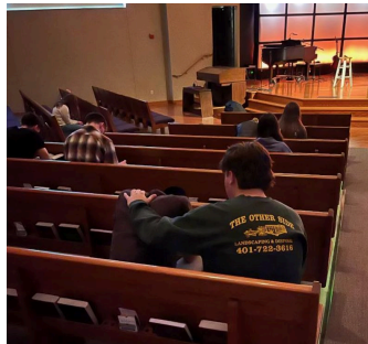
Outreaches that have impacted their friends and one another.