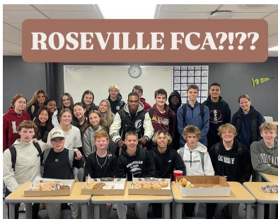
The Lord has astounded us over and over again. What a beautiful year of ministry it's been.