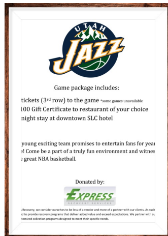
Utah Jazz Package Auction Donation Item