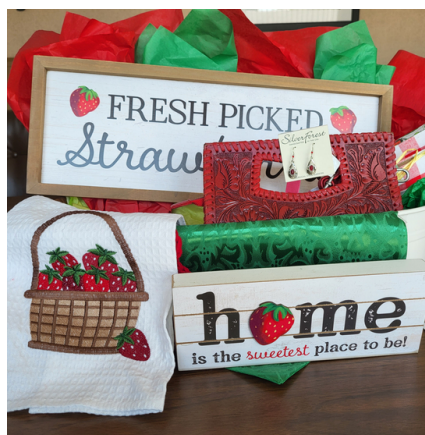
Strawberry Themed Basket Donated by Ivinson Memorial Hospital