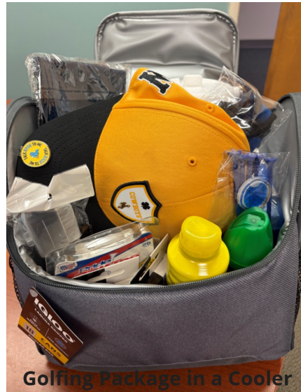
Golfing Package in a Cooler