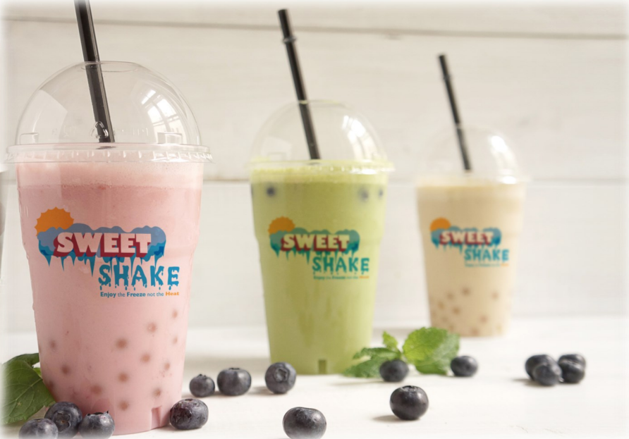
SWEET POTATO PRODUCT PACKAGING