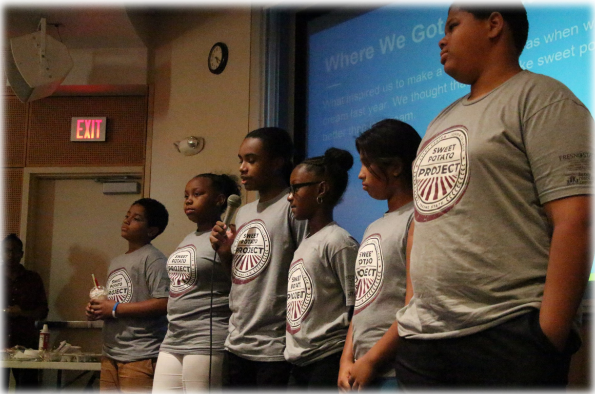
2018 PITCH DAY SECOND PLACE WINNERS "SWEET SHAKE"