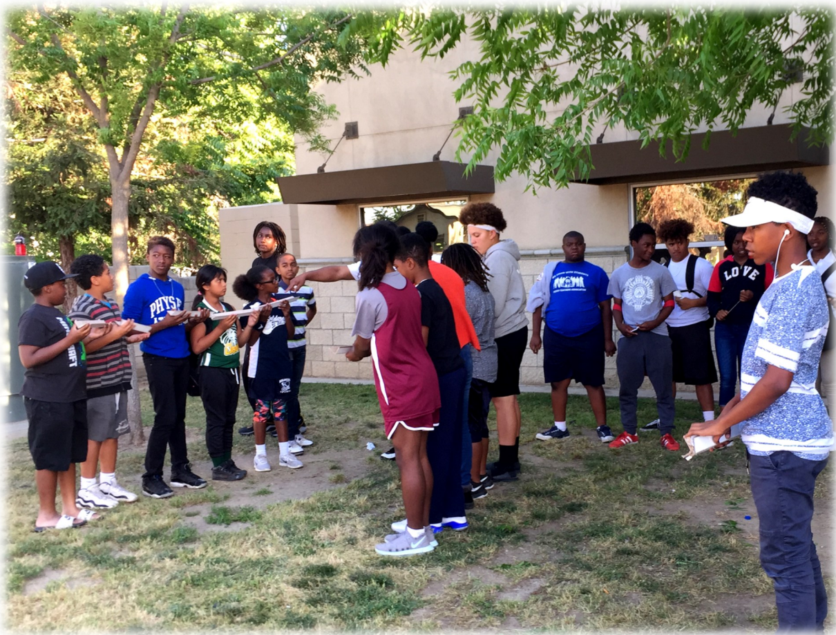
TEAM BUILDING OUTDOOR BALL BALANCE ACTIVITY

Sweet Potato Club begins with team building activities. Youth also discussed life, school and community issues in weekly group sessions.