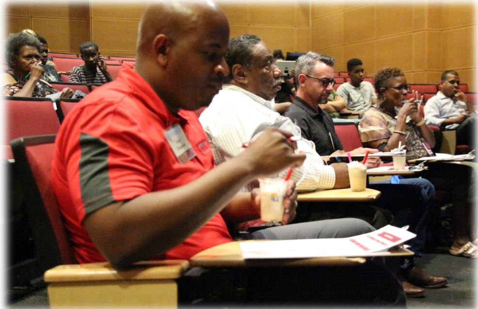
PITCH DAY JUDGES!