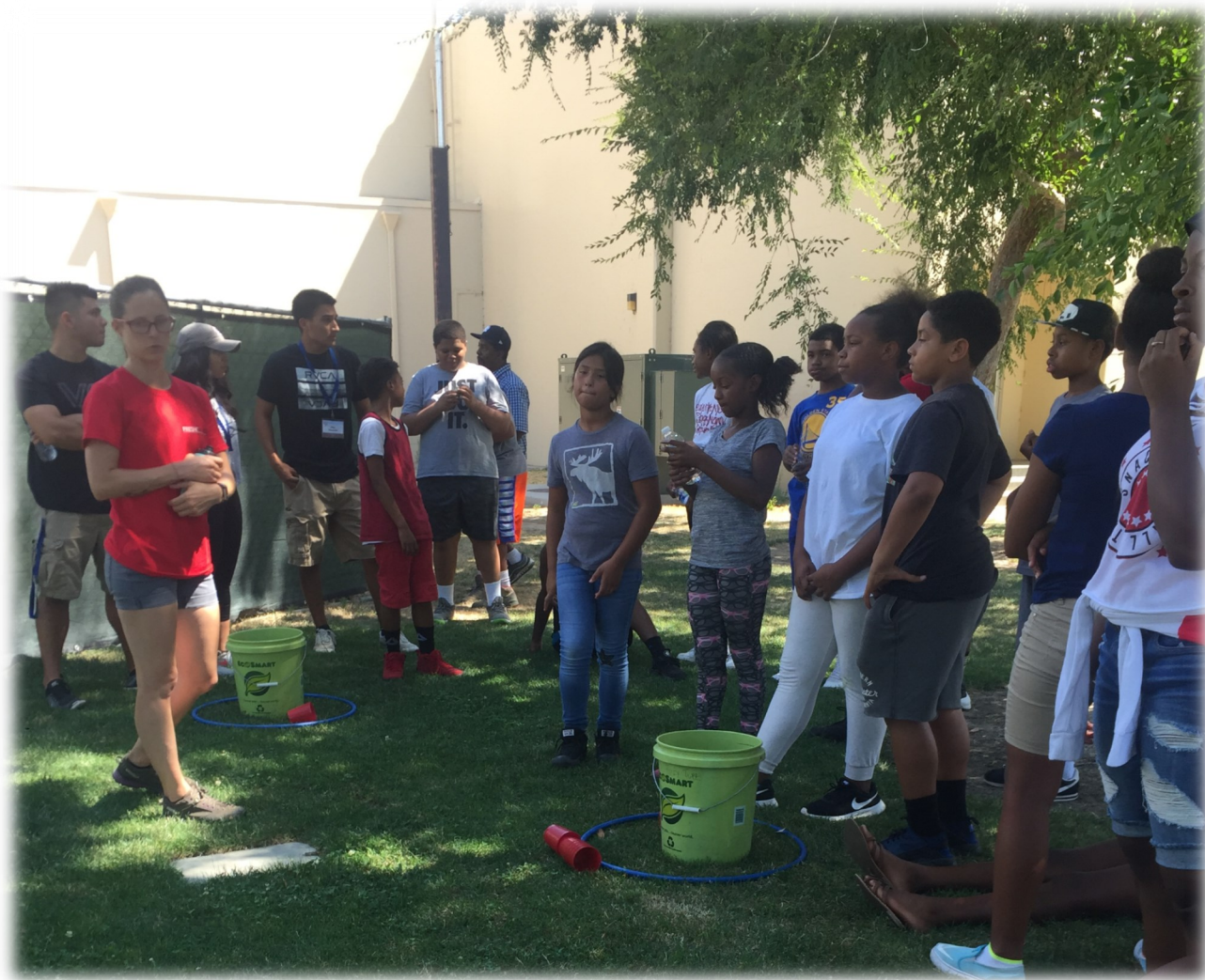
FRESNO STATE—ROPES COURSE: TO ENCOURAGE TEAM BUILDING & WORKING TOGETHER

Youth participated in entrepreneurial and business skills training taught by California State University, Fresno professors at the Lyles School of Business. Youth learned how to create a business marketing plan for turning sweet potatoes into a product that can be sold.