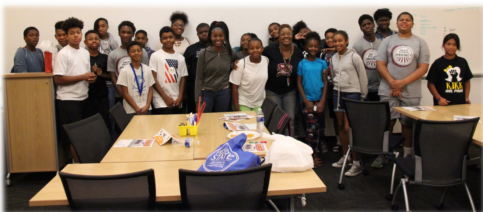
YOUTH PARTICIPATED IN 5-WEEK BUSINESS TRAINING AT FRESNO STATE LYLES CENTER FOR INNOVATION AND ENTREPRENEURSHIP