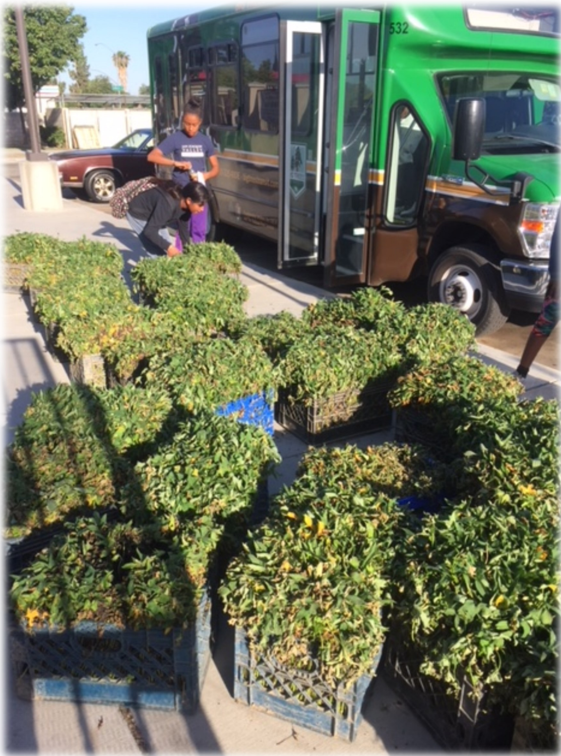
SWEET POTATO SLIPS DONATED BY: QUAIL H. FARMS

Youth learned about urban agriculture and planted sweet potato slips on an acre of land donated by the African American Farmers.