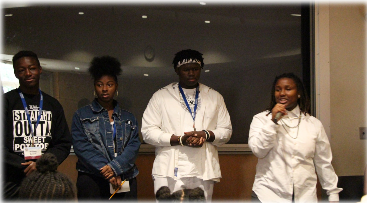
2018 PITCH DAY WINNERS "SP ROLLs"