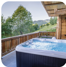
Pool & Spa