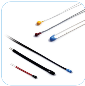
High Precision Thermistors