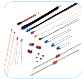
SMT and Thru Hole