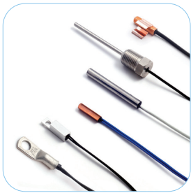
Custom Temperature Sensing Probe Assemblies