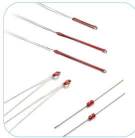
High Temperature Sensing Elements