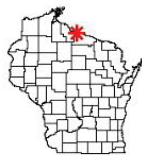
Project Location in Wisconsin

Sources Roads and Hydro: WDNR Bathymetry: Digitized by Onterra Aquatic Plants: Onterra, 2025 Map Date: 8-5-2025 TWH