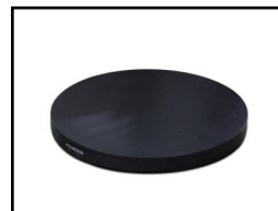
RELATED ITEM: 6.6' (2 METER) REVOLVE