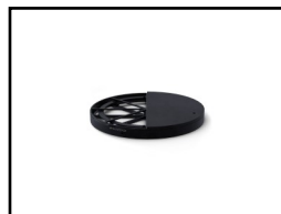
RELATED ITEM: 5' (1.5 METER) REVOLVE

Smartstage revolving stage platforms are built tough, yet pack tight for touring, and remain fast and easy to assemble by a small crew. We manufacture a wide range of sizes... from 6 inches to 90 feet. So our solutions have carried models, cars, bands, massive industrial equipment displays, custom art installations, and just about anything and everything in-between. If your team can imagine it, our revolving stages have helped bring it to life.