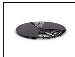
RELATED ITEM: 26' (8 METER) REVOLVE