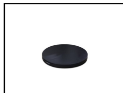
RELATED ITEM: 23.6" (0.6 METER) REVOLVE

Our clients have a wide range of staging needs, from intimate performances to full-scale experiential productions, and we meet them with an array of revolving stage options built for strength, size, and adaptability. Our 9' (3 meter) mid-size turntable features a sleek, low profile. Ideal for larger product or multi-product showcases, these stages are designed to impress. Whatever the vision, this workhorse delivers the action.