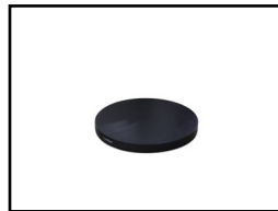
RELATED ITEM: 23.6" (0.6 METER) REVOLVE

Our customers' revolving platform and stage requirements vary from small venues to large events, so we offer turntable solutions in a multitude of weights, strengths, and revolve size. Our small-to-medium-sized revolving stages have a lower-profile, but remain robust and ready wow audiences. They're perfect for performers, dancers, and multi-product displays. If you can imagine it, our revolving stages have helped bring it to life.