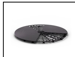
RELATED ITEM: 26' (8 METER) REVOLVE