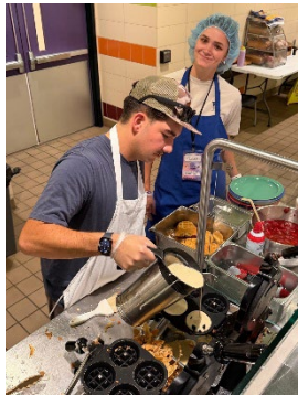
More pictures on the FBCSPYG page.