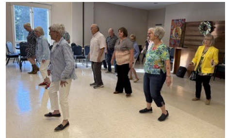
LINE DANCING – Line Dancing – the how to do – then – THE TO DO!!