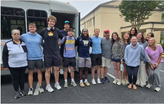
We were blessed to work with the Orlando Rescue Mission, Second Harvest Food Bank, and Give Kids the World Village.